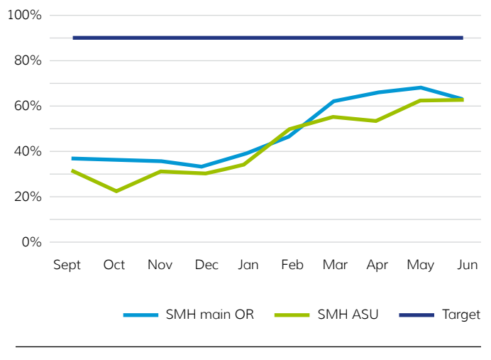
Figure 4: Steady improvement in FCOTS occurred during the implementation phase.

Improving frontline operational surgical services management was facilitated by a 30-minute daily huddle conducted at 13:00. This huddle is attended by representatives of units involved in preparing the patient for surgery. Proactive schedule and patient management, conducted by working closely with the surgeons' offices, significantly improved throughput, reduced cancellations and delays, and increased both patient and surgeon satisfaction.